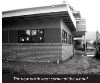
The new north west corner of the school

The school also received $75,000 from the National School Pride funding from the Federal govt. as part of the Building Education Revolution for our new soccer field, shade sails and artificial turf under the coverway. We are waiting to hear if we are successful in the third round to procure $30,000 for our music room.