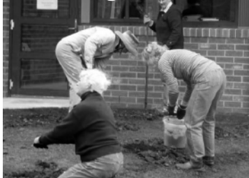
16/8/9 – Members of the Newham Walking Group assist in planting up an area of the school with plants donated by Bunnings.

East of the intersection (including the school and general store) and much of the land surrounding Newham village is zoned 'Rural Conservation'. This is a much stricter category geared towards environmental protection, with minimum lot sizes of 40 hectares (100 acres). Macedon Ranges has the largest Rural Conservation zone in Victoria.