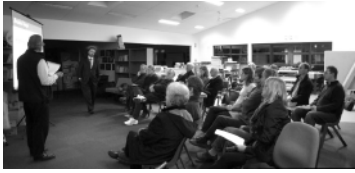
Newham residents met with a Shire Planning Dept official at the new school