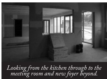
Looking from the kitchen through to the meeting room and new foyer beyond.

Plans for a high-quality lighted facility available to the entire community have been submitted to Council, seeking support for a grant from Sport & Recreation Victoria. A successful application will ensure the court goes ahead in the near future. The partnership between the school and planning group has received great support from across the community, with $10,000 worth of 'in kind' commitments made to the project.