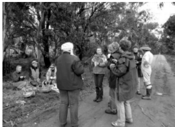
The 'Weedies' – In the interest of clearing understory weeds from local roadsides, the Walking Group has joined in association with Newham Landcare, to begin clearing and spraying broom along Jim Road near where it crosses Boundary Rd.

There are a number of overlays that apply in and around Newham which provide extra protection for wildlife, vegetation, waterways and significant landscapes such as the Jim Jim and Hanging Rock.